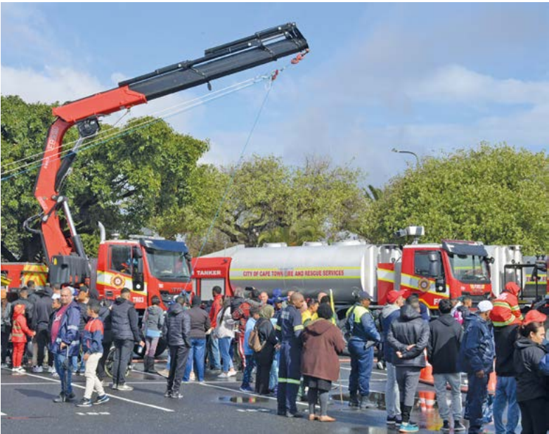
Big thanks for being brave: The Mother City's people attended the City's International Firefighters' Day commemoration in Athlone in their numbers to honour the brave officers of our Fire & Rescue Service, catch a closer look at their vehicles, and step into their shoes for a moment.

On 4 May, thousands turned out to commemorate International Firefighters' Day at Athlone stadium. The day is spent honouring firefighters for their service and remembering those who lost their lives in the line of duty. Capetonians got to interact with the City's Fire & Rescue Service staff and were able to get a closer look at the fire vehicles and the aerial support craft. They could also get dressed up in fire gear, have a crack at some of the fitness challenges that firefighters need to pass, and see first-hand how vehicle extrication and other firefighting operations are performed. Summer 2023/24 was arguably one of the busiest on record for Cape Town's firefighters. They attended to 20 164 incidents, including 10 507 vegetation fires, 1 335 residential fires in informal areas, and 1 004 in formal areas. Preliminary indications are that since 1 December 2023, the Service's contracted helicopters logged at least 280 hours, and the spotter plane 132 hours.