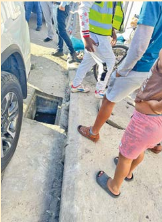
Senseless spending: The City has to spend vast amounts of public money on fixing vandalised sewer systems. This seems a shame, as the funds could have been used to address critical community needs.

Help us catch the culprits Sewer blockages and overflows can have far-reaching consequences, including contamination of water sources, infrastructure damage, and disruption of essential services. Responding to these incidents diverts valuable resources away from other critical community needs. If you spot anyone tampering with manhole covers or dumping foreign objects into the sewer system, report it to 0860 103 089. Your vigilance can help protect precious community infrastructure.