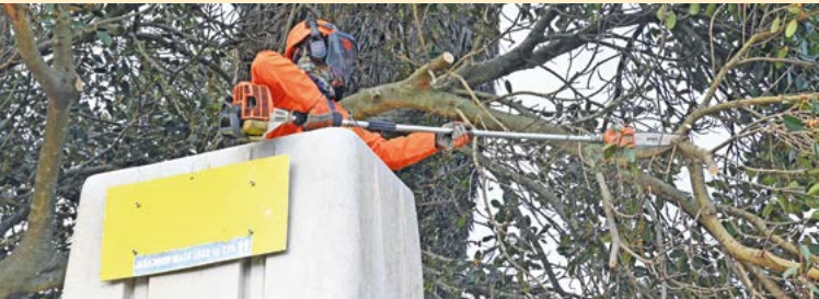
Seeing the wood AND the trees: This tree-trimming job in Goodwood is one of thousands the City's specialised teams are attending to as part of the winter preparedness plan.

While residents should regularly assess trees on City land in their areas, they should not trim or remove