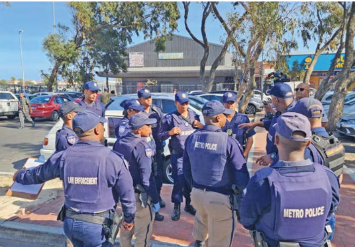
Reinforcing law enforcement: The targeted deployment of additional enforcement officers to central Bellville looks to replicate the successful trial in central Cape Town, which is well into its second year.

The City is taking the lessons learnt from the dedicated deployment of law enforcement officers in central Cape Town, launched in July 2022, and trialling the concept on a smaller scale in central Bellville. Small deployments will also occur in Mitchells Plain and Wynberg. Boots to boost business These targeted deployments to the metro's business hubs are in addition to the regular Area Law Enforcement, Traffic and Metro Police deployments and are aimed at increasing foot traffic and boosting economic activity. The 18 dedicated officers deployed to