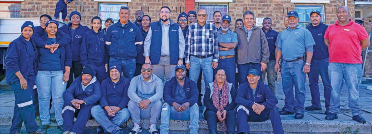
Be proud of your 'pad': With over R1 billion set aside for maintenance and upgrades at City rental units in the next three years, a new campaign is asking tenants to take responsibility for their units, report maintenance issues, and stamp out vandalism.

Reducing vandalism of Council units will allow the City to do much more with its maintenance budget and free up teams for emergency work. To report suspicious behaviour in this regard, call 021 480 7700.